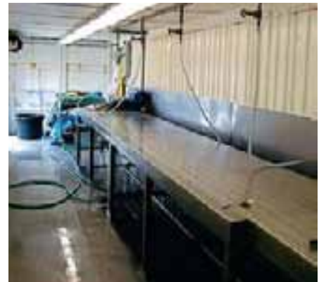
NSEDC and the Alaska Department of Community and Economic Development provided funding for the Savoonga halibut processing plant.

A processing facility was not the only objective of the St. Lawrence Island Halibut Project. NSEDC, the Bering Sea Fishermen's Association, and a Marine Advisor from the University of Alaska worked with the community of Savoonga and the Ivisa Fishermen's Association to