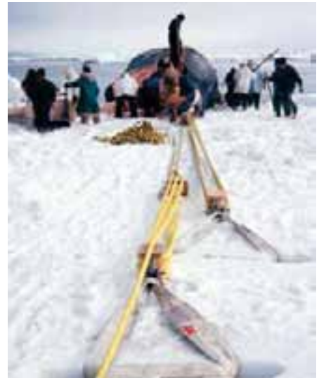
Savoonga block and tackle purchased through an Outside Entity Funding grant.

The construction of the Cold Storage Facility upgrades at NSSC in Nome commenced in summer 2007. LCMF, Inc. is the Architectural & Engineering Firm and Alaska Mechanical, Inc. is the General Contractor. The construction will replace the existing cold storage system of portable freezer vans that the NSSC currently uses with a permanent structure that will have freezer rooms capable of holding 175,000 pounds of palletized and racked crab, halibut, salmon, cod and other product, to maximize efficiency. The facility will be constructed on a