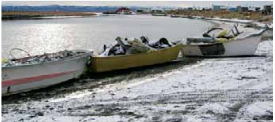
Boat loads of debris were taken along the shoreline of Unalakleet through the Clean Waters Program.

The Clean Waters Program is another program that NSFR&D has shown leadership in. The success of the 2006 clean-up brought recognition for the program and we were requested to fly the entire coast of the Alaska Bering Sea to inventory the extent of marine debris in 2007. Local site clean-ups were completed in Shaktoolik, Unalakleet, and White Mountain. The total weight of