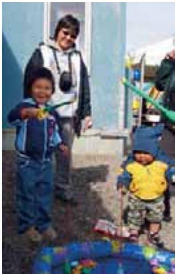
A future Gambell fisherman shows his latest catch - what a smile! July 2007