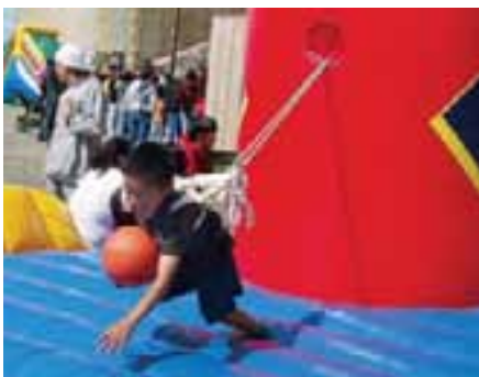
A bungee basketball participant is being cheered on at the Shaktoolik Fishermen's Fair, June 2007