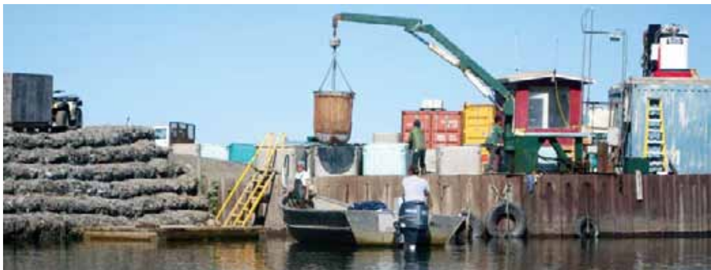
Salmon being offloaded at the Norton Sound Seafood Unalakleet processing plant.

Altogether fishermen were paid a total of $651,829.70 for salmon, with the majority of the income coming from coho salmon.