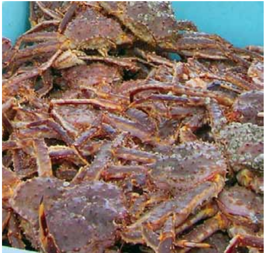
Norton Sound Red King Crab

NSEDC harvested 23,611 pounds of CDQ red king crab in Norton Sound during the second quarter working with eight local fishing boats delivering to the NSSC in Nome. Only 14 pounds of the combined NSEDC and Yukon Delta allocation was not harvested.