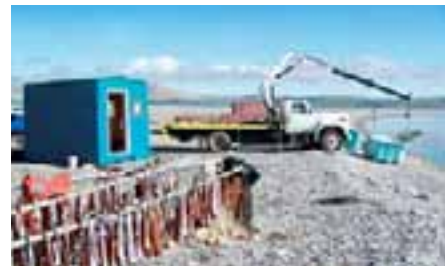
Teller fishery buying station

Norton Sound. The king salmon run was poor, and the pink salmon run was not as strong as expected.