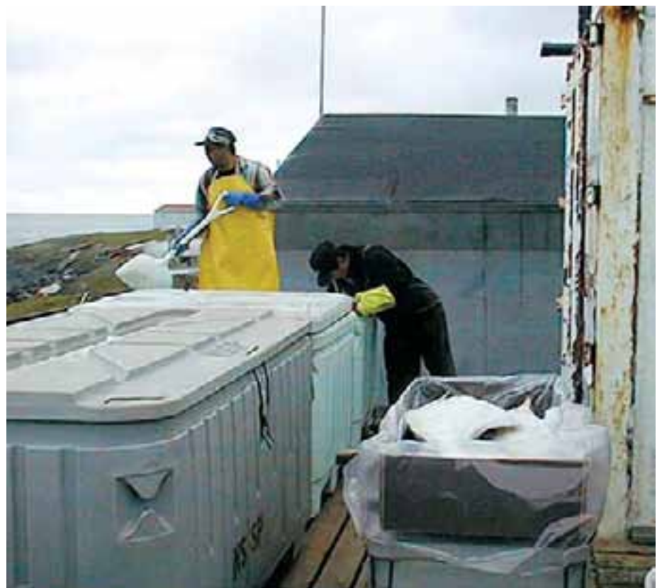
Savoonga plant workers icing halibut and preparing totes for shipping to Nome.

provide technical support and knowledge to local fishermen on product quality, the use of longline fishing gear, the regulatory process and oversight of the halibut fishery by the IPHC, National Marine Fisheries Service, Alaska Department of Fish & Game, and the new CDQ halibut management systems.