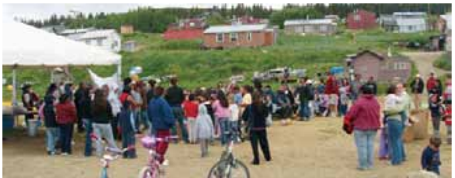
Scene at the White Mountain Fishermen's Fair, June 2007