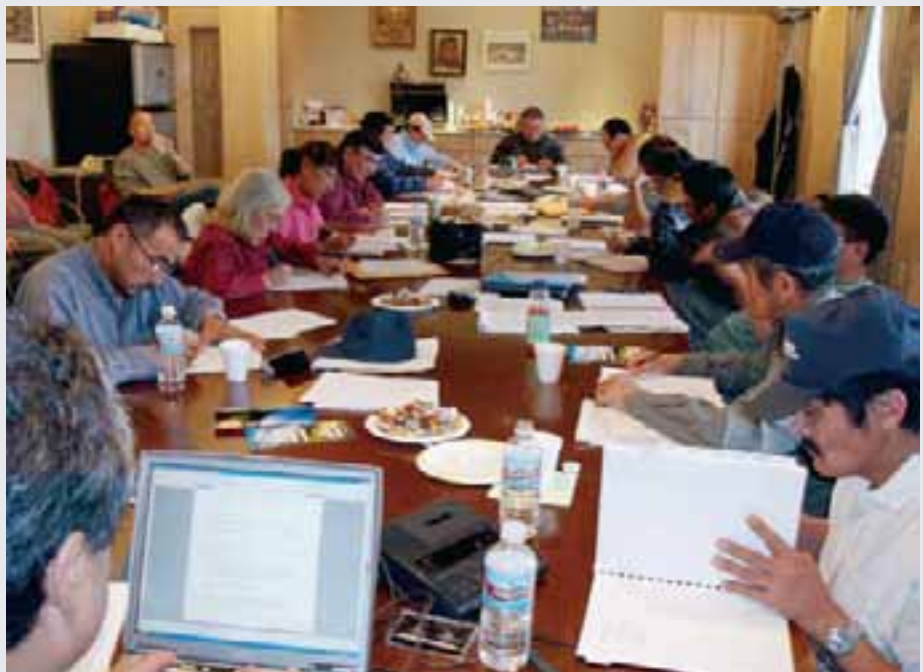
NSEDC Board of Directors hard at work at the 2007 3rd quarter meetings.