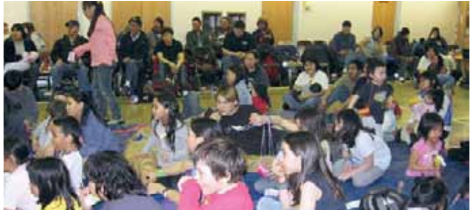
There was a great turnout at the Diomed Fishermen's Fair, March 2007

Recognizing that the results and benefits of this program are substantial and far reaching makes NSEDC extremely proud and eager to invest such considerable time and resources into the program. Participants not only receive the benefit of lower fuel prices than they would receive going out to bid independently, but they also benefit from lower administrative costs by NSEDC coordinating