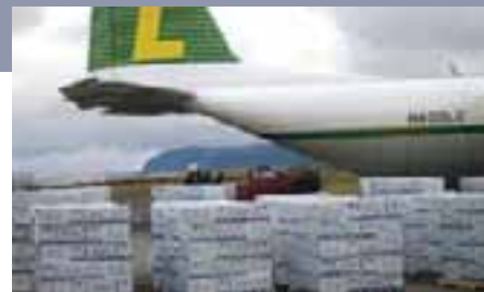
Pallets of salmon processed and ready to ship from Unalakleet

The 2007 Unalakleet salmon season went well overall. There was a decent chum salmon fishery in Moses Point and a very large coho salmon fishery in eastern