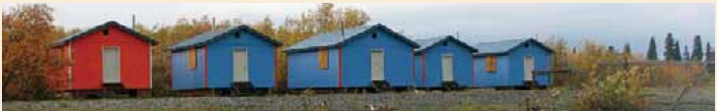
The NSEDC Outside Entity Funding Program provided funds for upgrades to the Shaktoolik Youth & Elders Camps