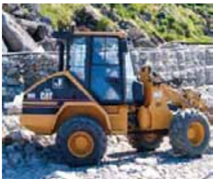
This 2003 CAT 908 Loader was purchased for Diomedé through the NSEDC Boat Ramp Program.

Loader and two spare buckets/forks for $118,278.66.