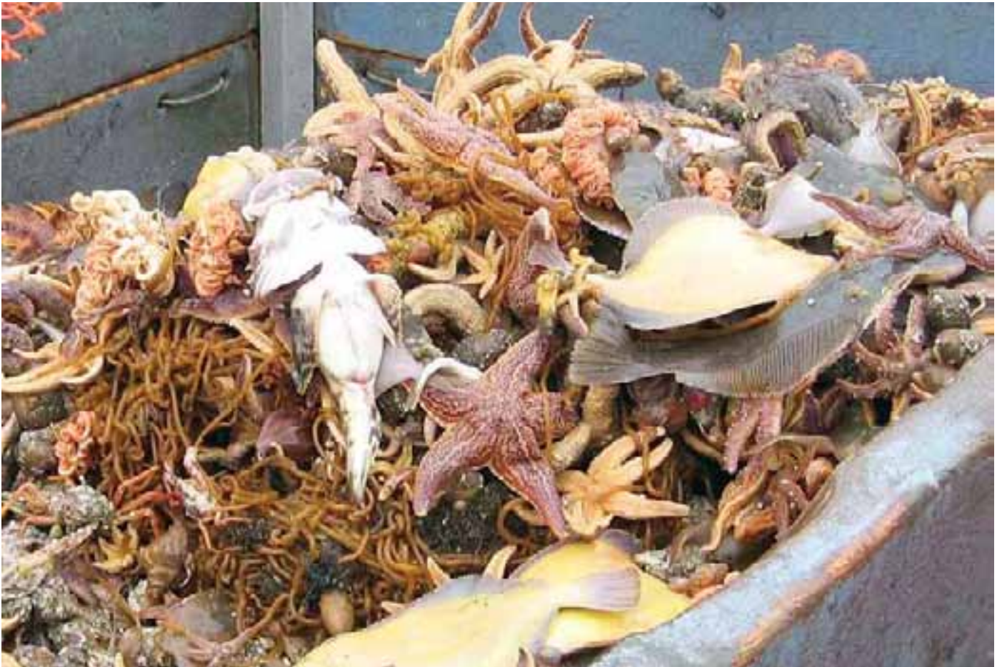
This picture shows an example of sealife found in the Bering Sea during an R/V Pandalus survey.

The CDQ harvest in bottom-trawl fisheries for Atka mackerel/POP, yellowfin sole and rock sole accounted for almost 2% of all CDQ royalties. NSEDC harvested the entire CDQ allocation of Atka mackerel (661 tons) and POP (186 tons), as well as a small amount of quota transferred to NSEDC from another CDQ group. USS