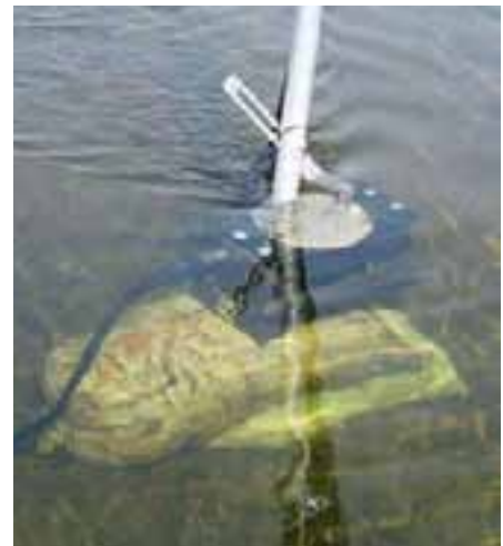
Didson sonar at work on the Shaktoolik River.

The Seward Peninsula has enjoyed much improved red salmon runs over the past decade. NSEDC has played a significant role in that improvement by fertilizing Salmon Lake to improve productivity. In 2007, NSFR&D distributed 16 tons of fertilizer in Salmon Lake and monitored plankton levels in the lake to document the effect of fertilization. NSFR&D conducted smolt research on the Pilgrim River in cooperation with the Alaska Department of Fish and Game (ADF&G) and the U.S. Geological Survey